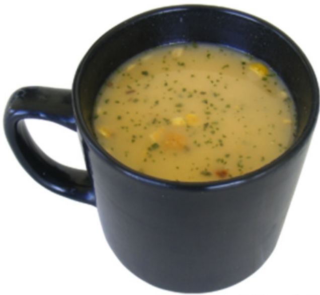
Cup of soup